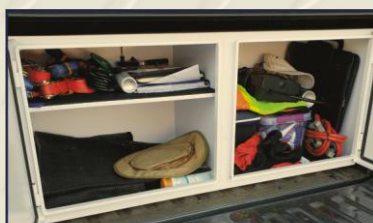
Anti-skid shelf and floor