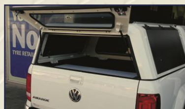
Double lockup - no access