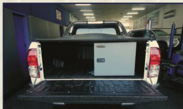
SecuriBoot™ Half Boot