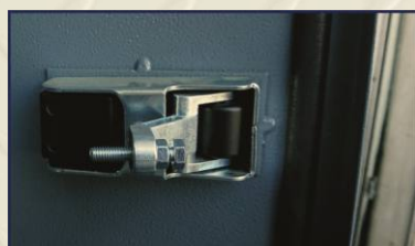
Durable security lock and a waterproof rubber seal