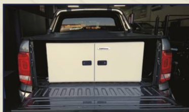
Centre or side mount