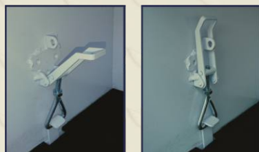
Lockable - quick mount and release mechanism