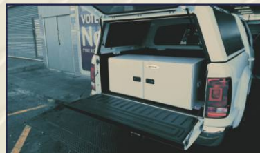
SecuriBoot™ Full Boot